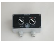
Operating box for Clear View