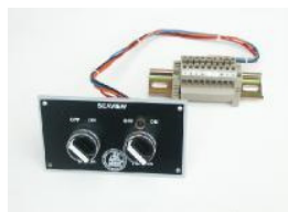
Operating panel for Clear View