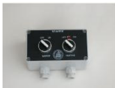
Operating box for Clear View