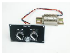
Operating panel for Clear View