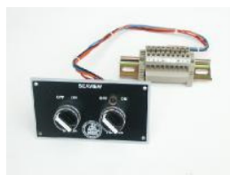
Operating panel for Clear View