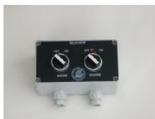
Operating box for Clear View.