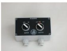
Operating box for Clear View