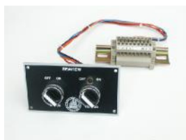
Operating panel for Clear View